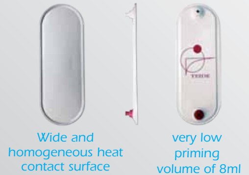
Wide and homogeneous heat contact surface