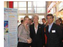
CENTRE: Ms. CHRISTINE LAGARDE MINISTER OF COMMERCE OF FRANCE

MEDICA TRADE FAIR [15-18 NOVEMBER – DÜSSELDORF – GERMANY] STERINIS STAND N° : 7AE26A →