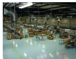
View over Sterinis® Production Line