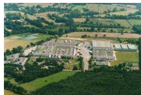
View over Canon® manufacture site