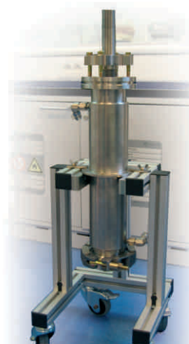
HPLC column 76 x 500 mm (i.d x l)